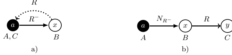
Fig. 2. A situation where rewriting away inverse roles leads to missing entailments

Definition 4. Let \mathcal{K} = (\mathcal{R}, \mathcal{T}, \mathcal{A}) be a normalised \mathcal{SHOIQ} knowledge base. A (possibly inverse) role R is generating in \mathcal{K} if there exists a role R' occurring in \mathcal{T} in an axiom of type N2 or N4 such that R' \sqsubseteq_{\mathcal{R}}^* R .